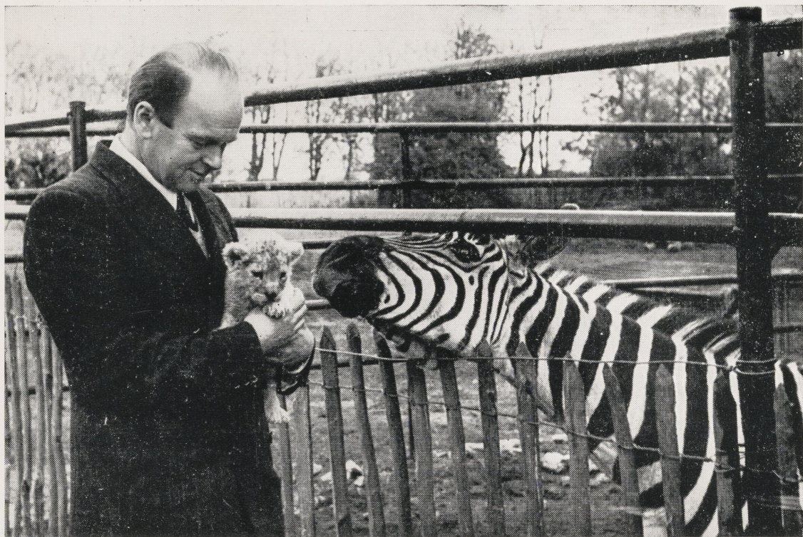
Peter Scott, the well known ornithologist, introducing a lion cub to a zebra at Chester Zoo.