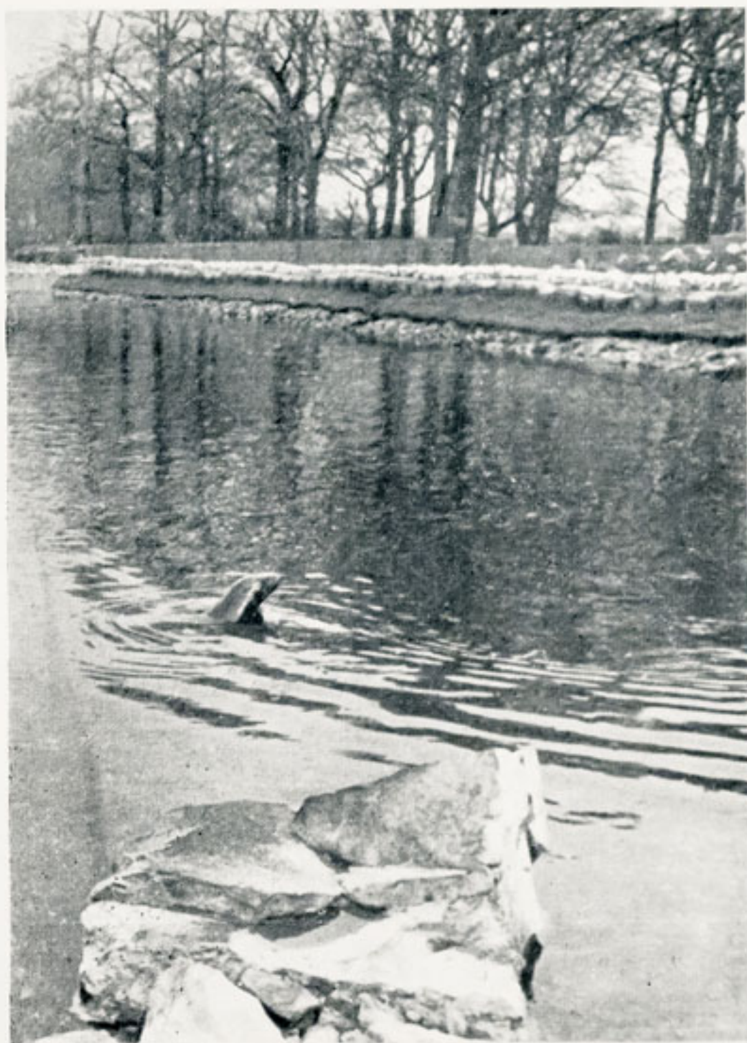
A view of our Sea Lion Pool that gives some idea of the length and breadth of water in which these animals are able to swim and play.

We hope we are not being a little premature, but this year our Axis Deer have so far succeeded in rearing their young Fawn. Ever since these animals arrived here, six years ago, they have produced a Fawn annually, but they have not in the past succeeded in rearing it beyond the first day or two. On one or two occasions however, we are sure it has been the over enthusiasm of the keeper which has caused the trouble. On another occasion the Fawn, soon after it was born, became a victim of a very severe thunderstorm and cloudburst. However, this year the Fawn had apparently been born a day or two before it was actually dis-