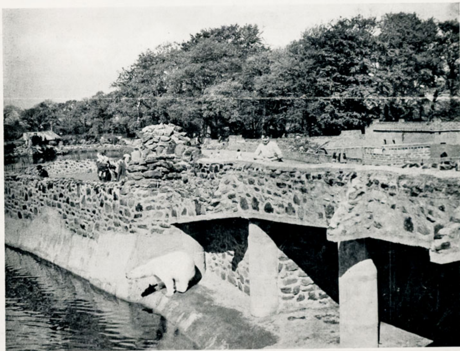
An attractive photograph taken from the terrace of the Polar Bear Enclosure, showing Raccoon Wood in the background, the mixed Bear Enclosures on the right, the Sea-lion Pool on the left and corner of the Polar Bears Enclosure in the foreground.