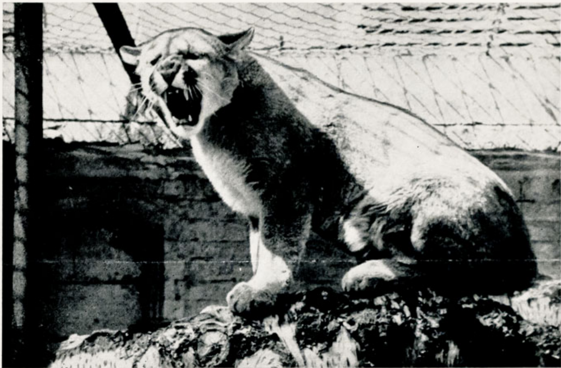
The Puma snarls his defiance at the photographer.

bang in the middle of a busy day, when the main exhibits in the Zoo had never seemed more popular—whatever next. So I pressed on with the job in hand, promising myself the peace and tranquility of the twilight hour that now is mine, to record for you a perfect June day at the Zoo. But for the next few hours there was the child who was lost, to comfort and care for, an equally distressed parent to calm, whilst I endeavoured to locate the wandering offspring, then a slight casualty to be directed to the First Aid tent.