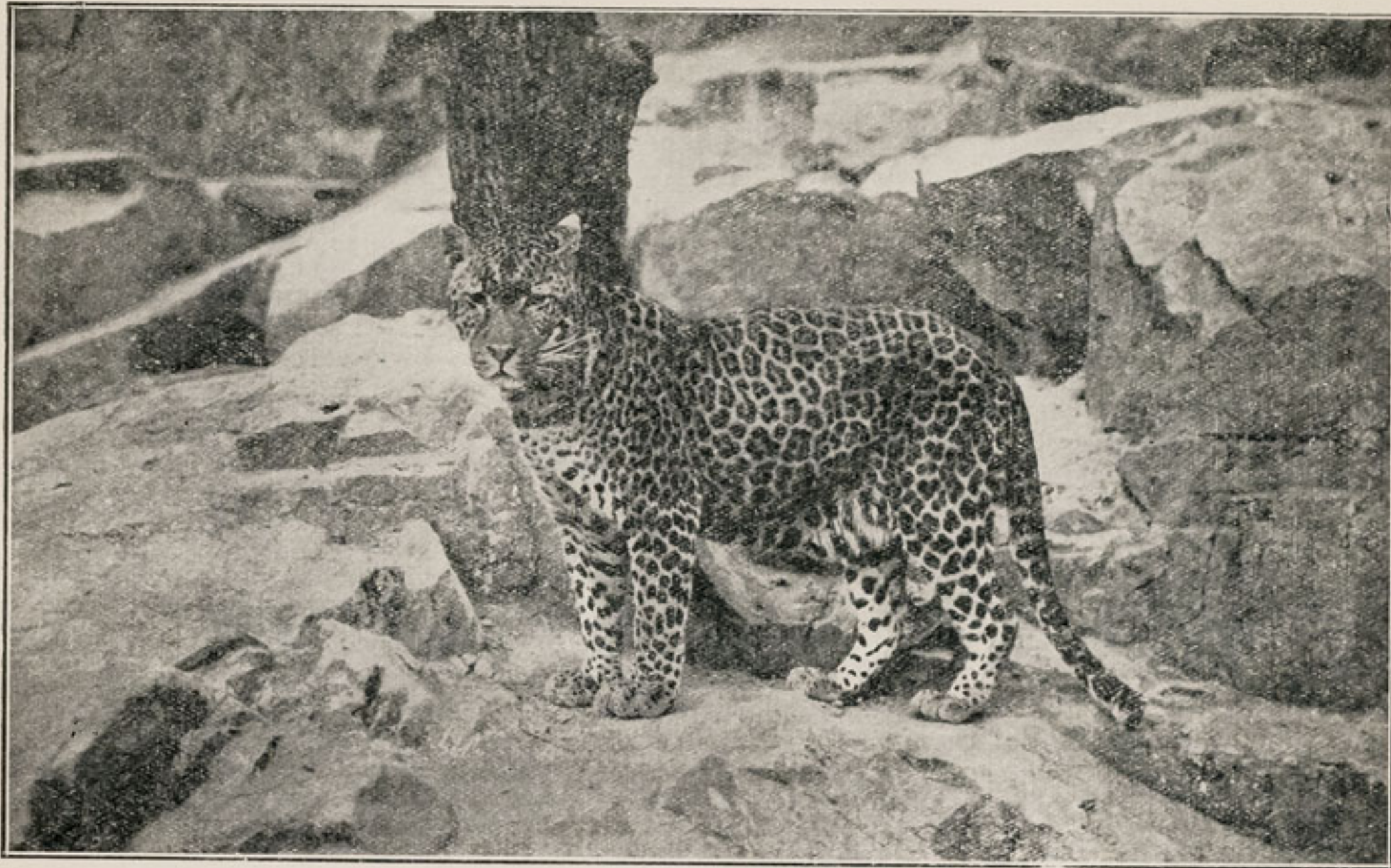
A Leopard in Edinburgh Zoo