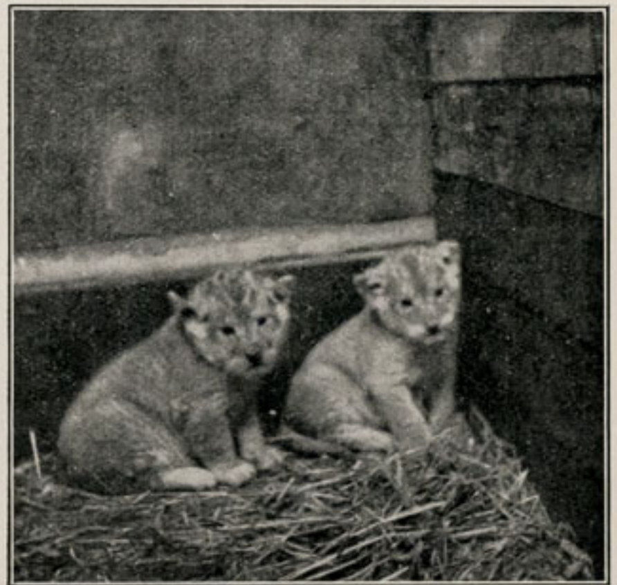
Young Lion Cubs born in the Zoo