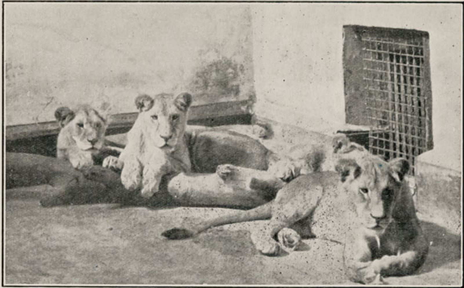
Group of Chester Zoo's Lionesses