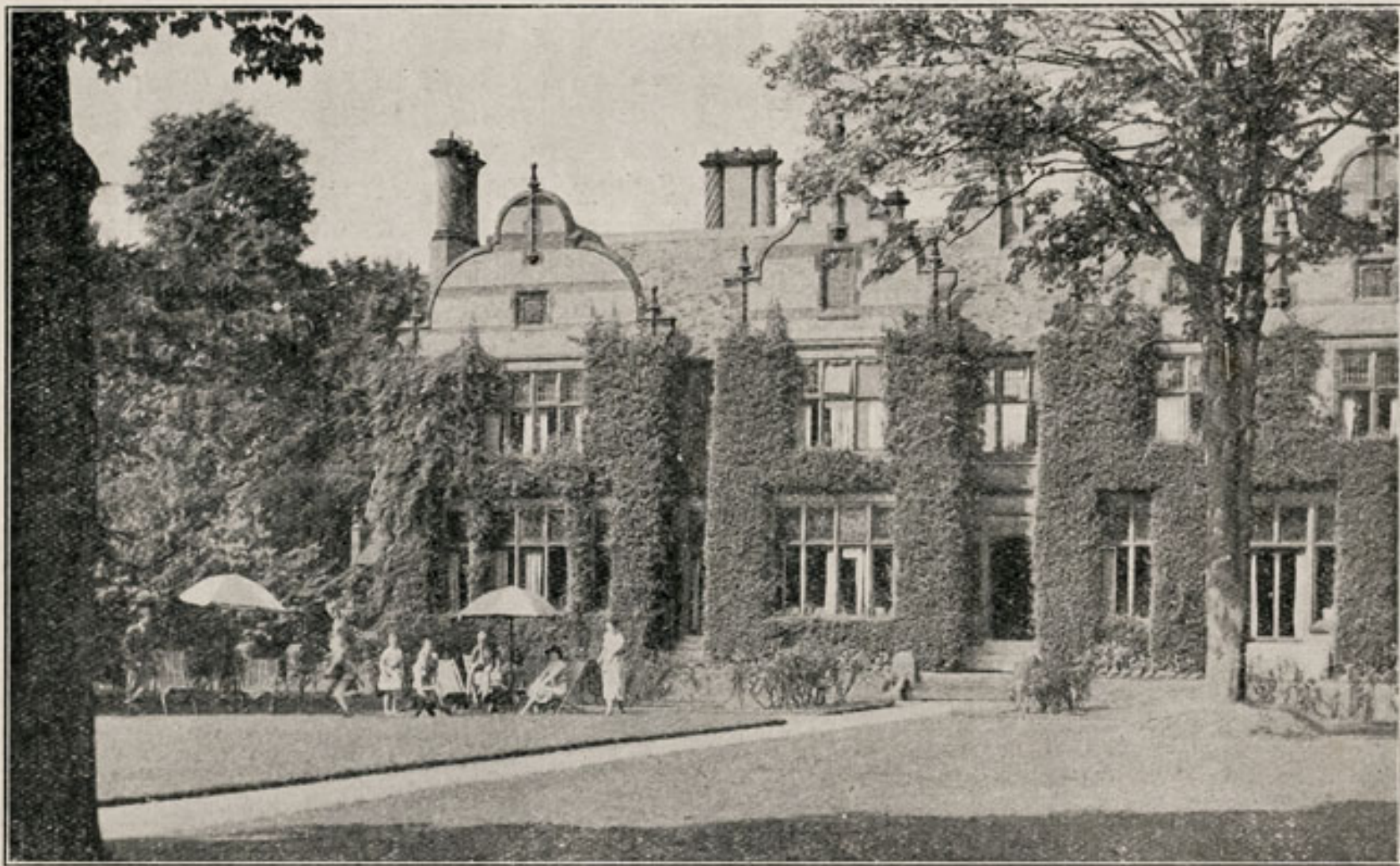
A pleasant scene in pre-war days

The 1943 Season is in full swing, and all our time is being taken up with the thousand and one jobs which have to be attended to in a zoo which caters for the public, and this year more so than ever before, we are finding it extremely difficult to get labour, so this issue of Zoo News will comprise in the main photographs as we have very little time in which to write news items.