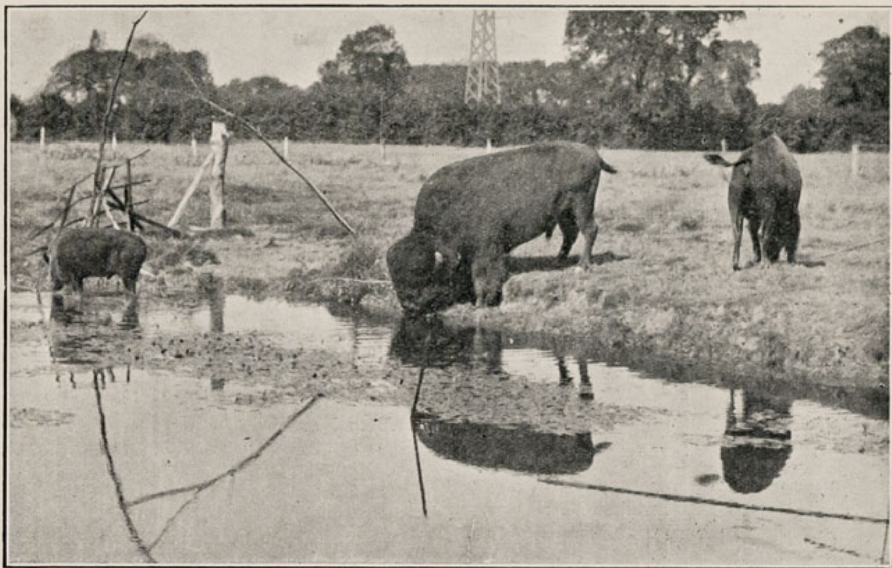
Bison at the Pond