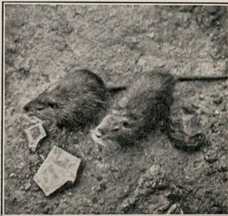
Coypu, the South American Rat