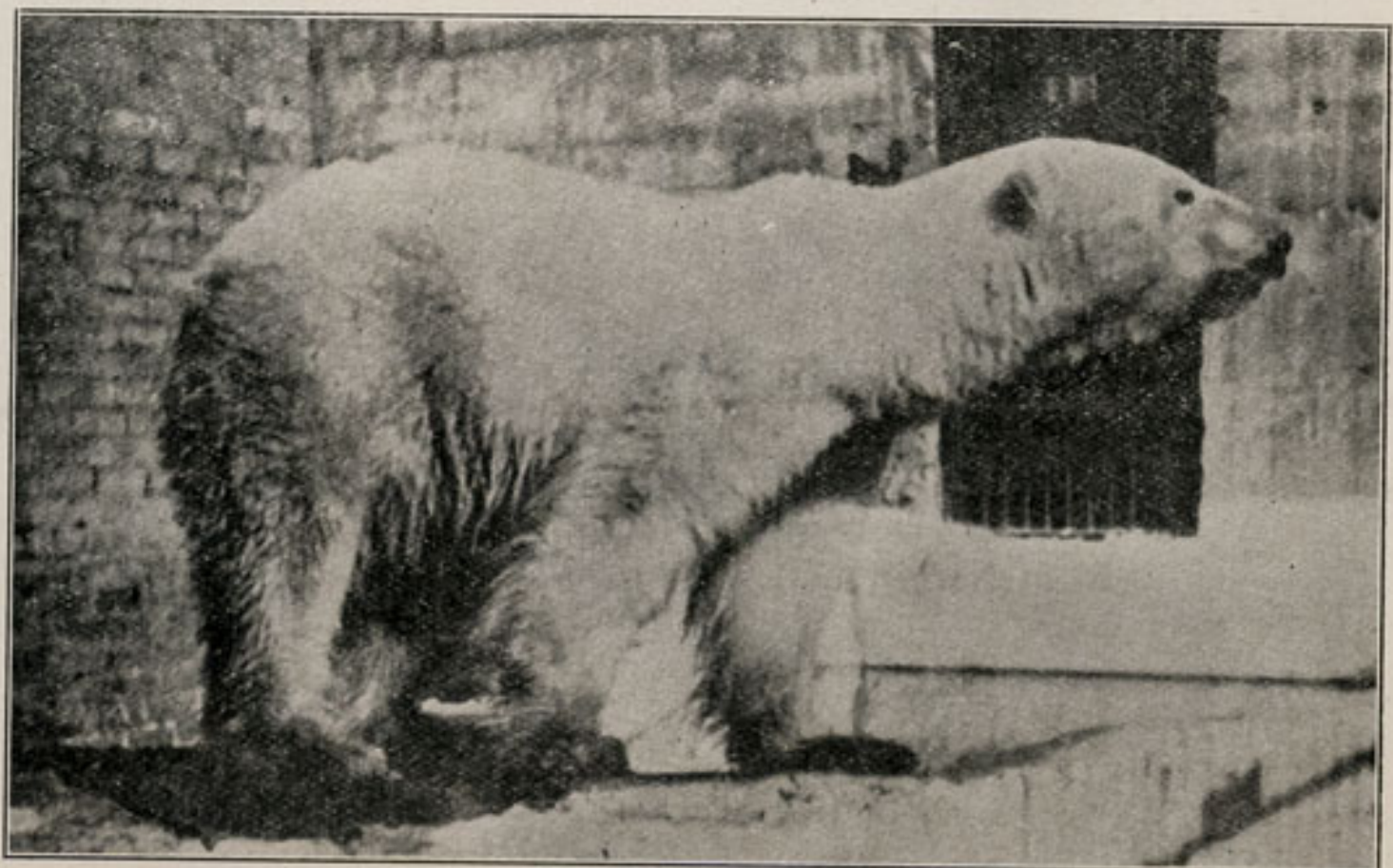
Punch, the Polar Bear, and oldest animal in the Zoo