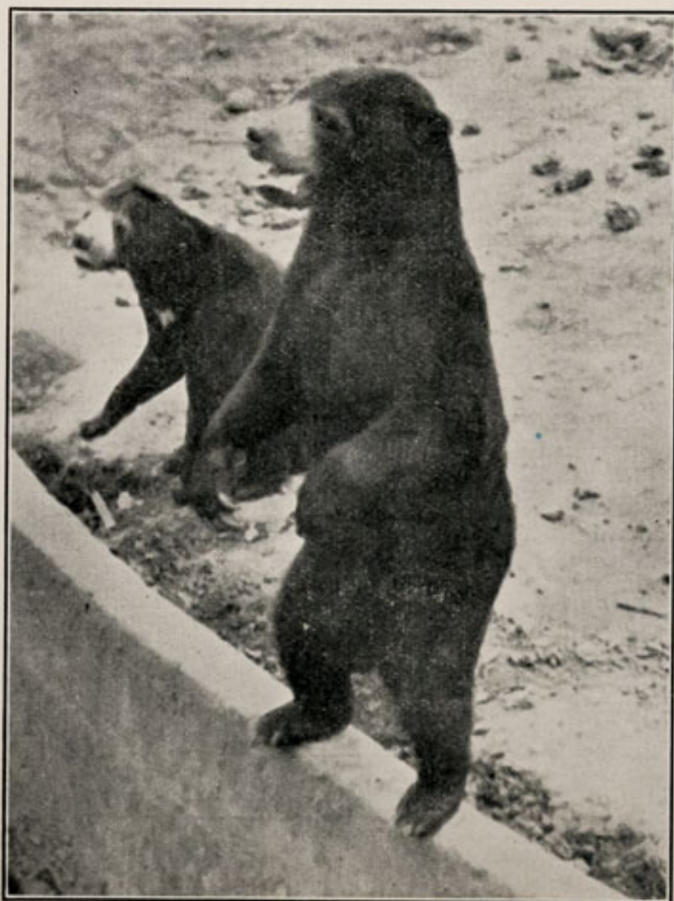
Malayan Bears begging for tit-bits