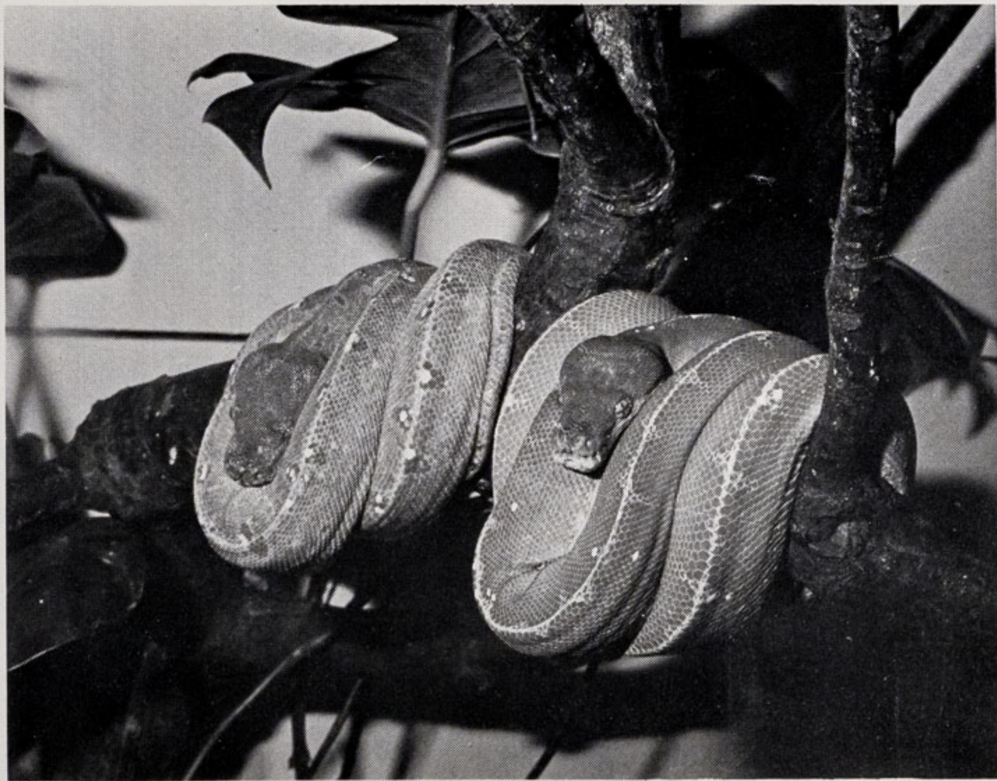
GREEN TREE PYTHONS