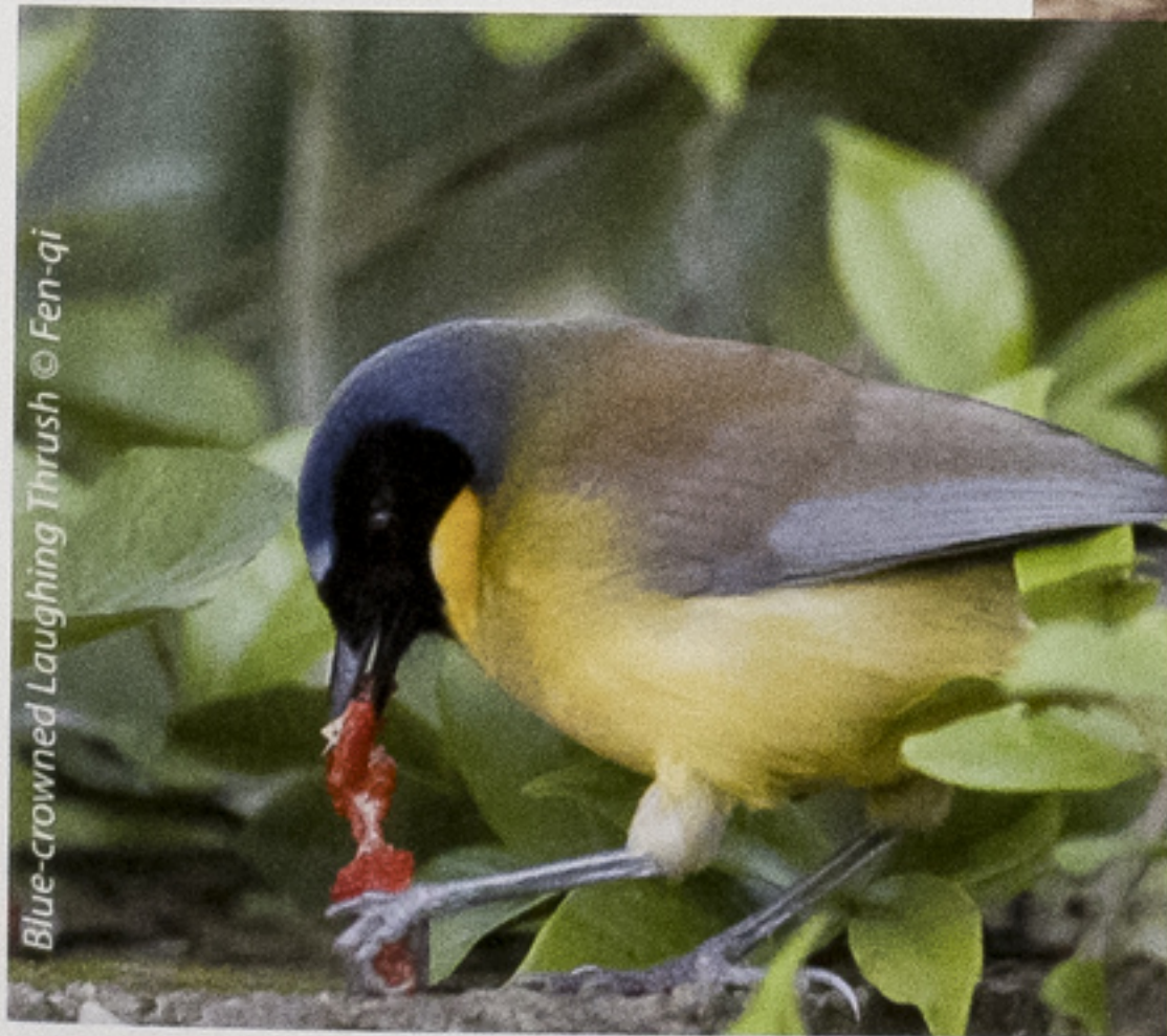
Blue-crowned Laughing Thrush