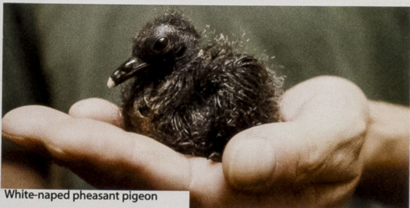
White-naped pheasant pigeon