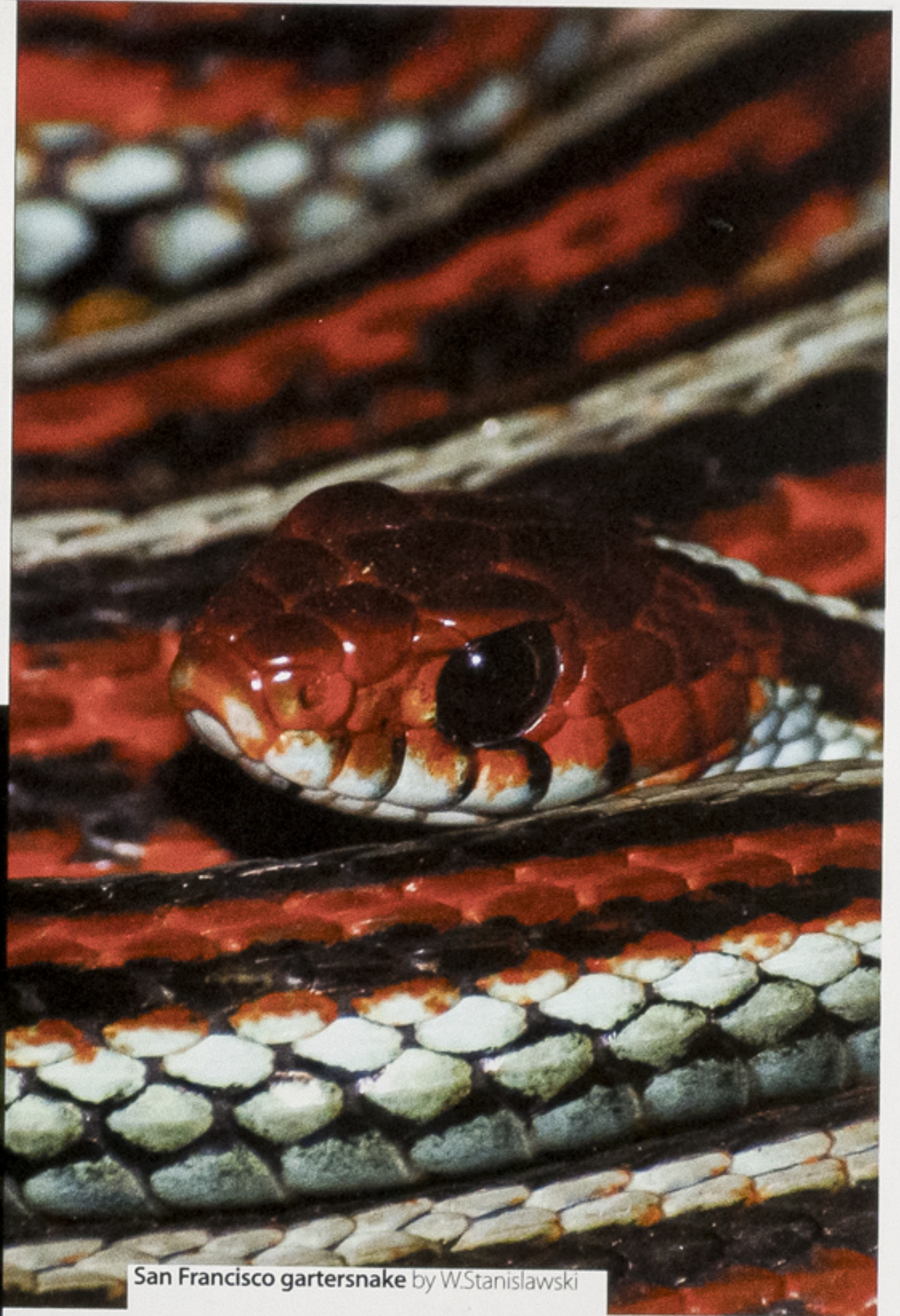
San Francisco gartersnake by W.Stanislawski