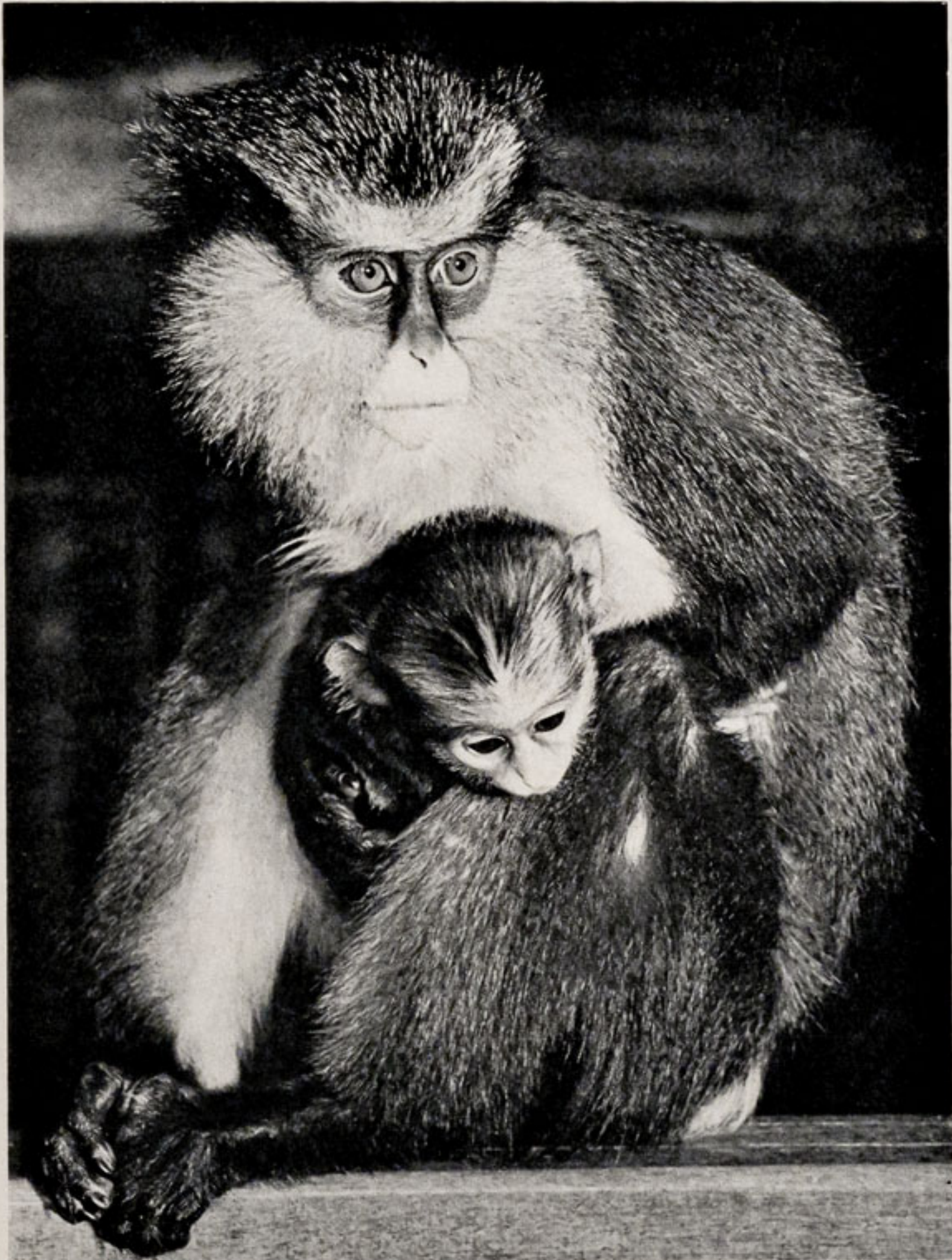
"MINNIE" AND "NETTA"