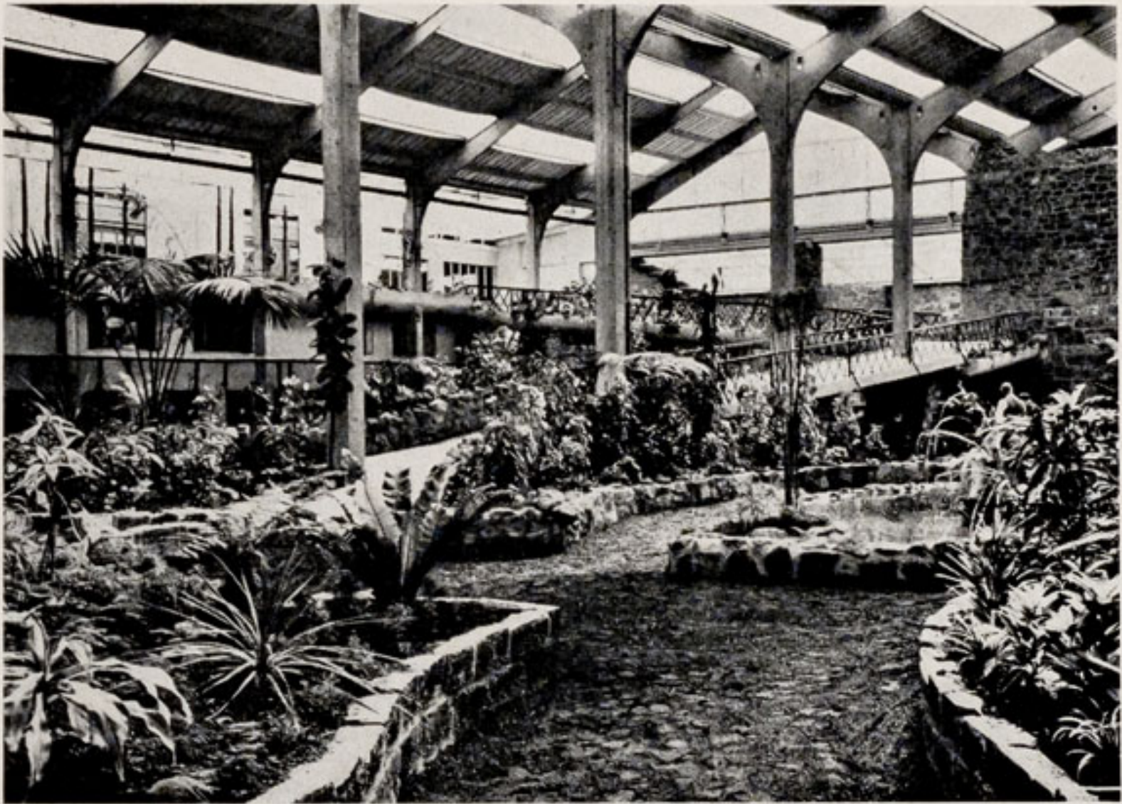
LOOKING UP TO THE TOP WALK OF THE TROPICAL HOUSE.