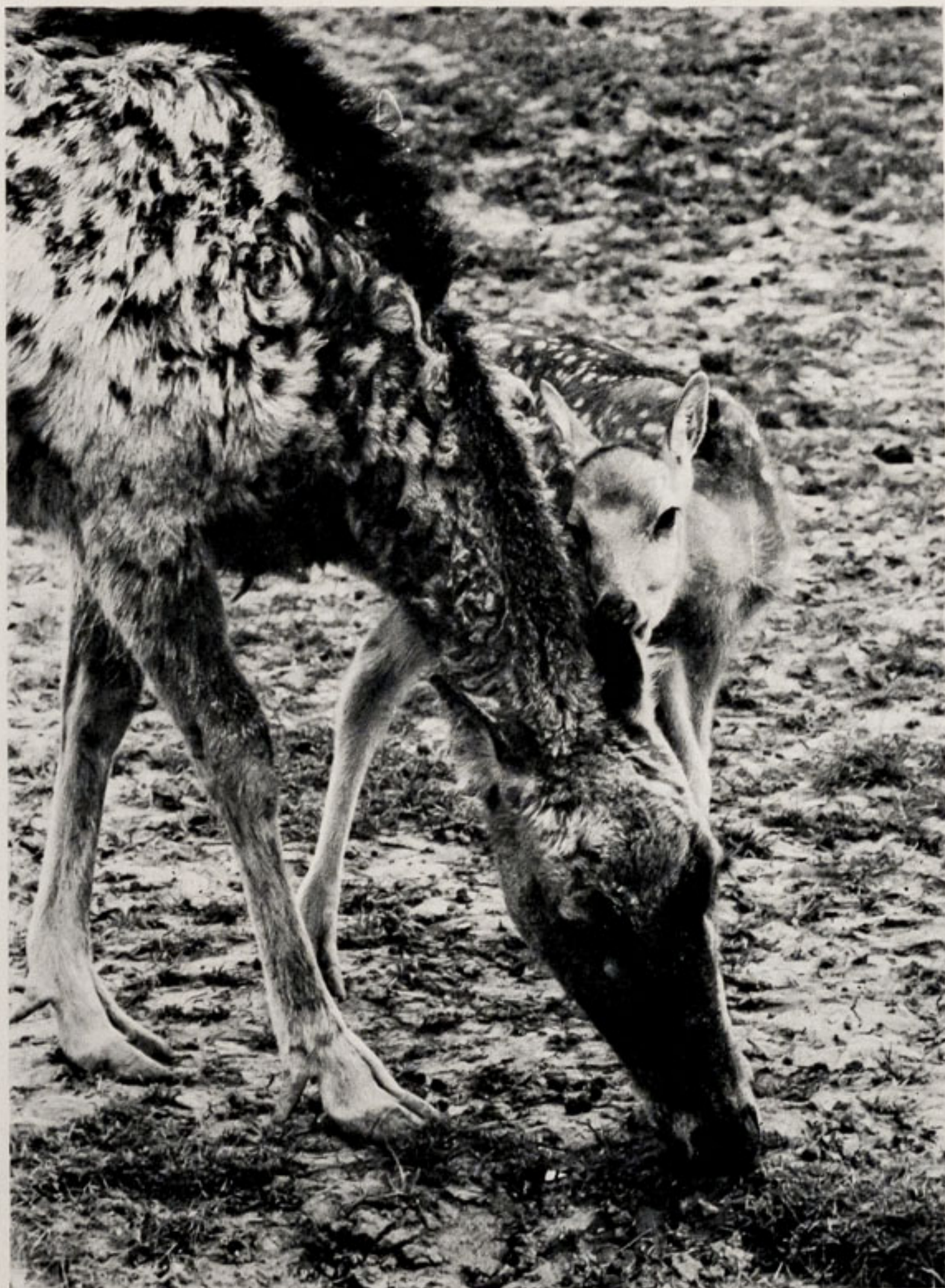
MOTHER AND SON