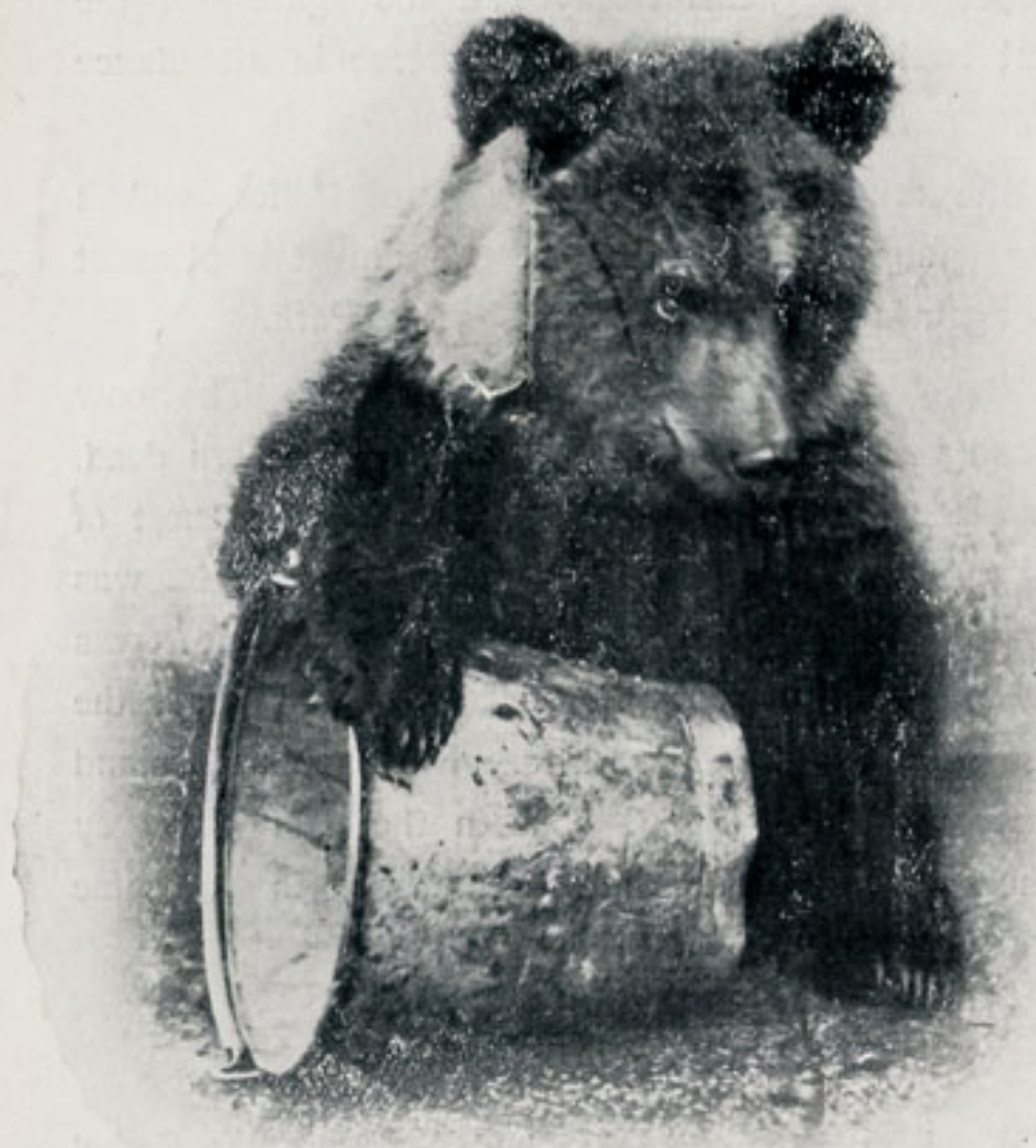
Trotsky, as he was when he first arrived at the Zoo.