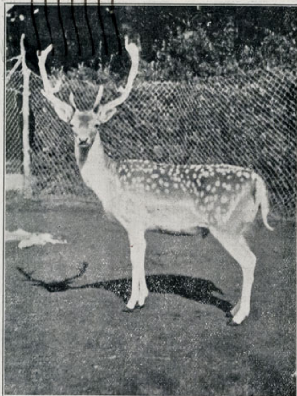
A Stag Fallow Deer.