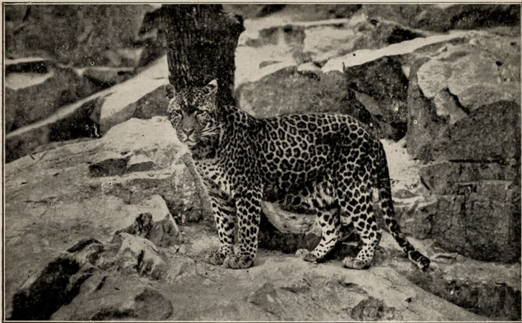
Photograph of Leopard in Edinburgh Zoo.