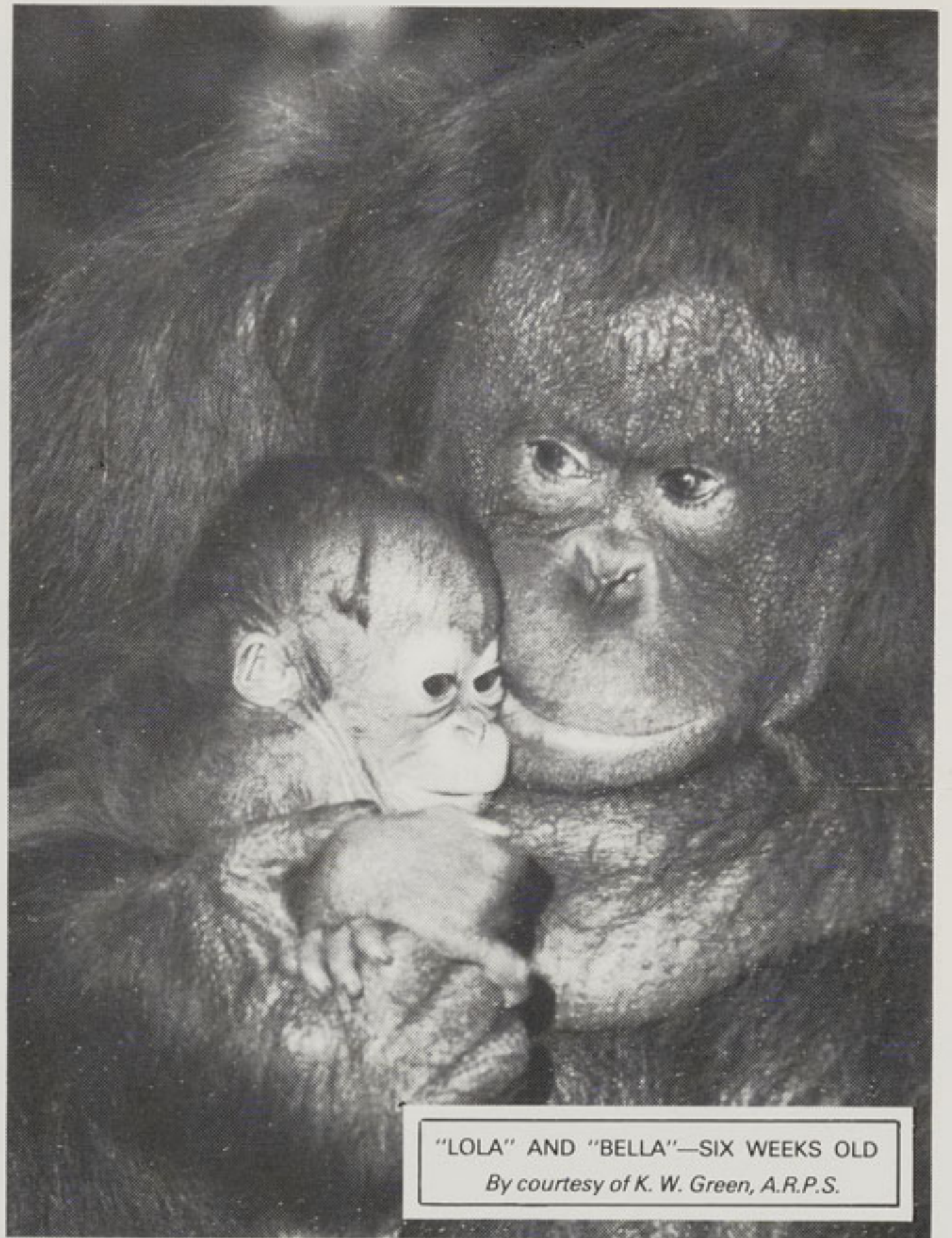
"LOLA" AND "BELLA"—SIX WEEKS OLD

Orang-utan means "Man of the Woods", and these animals are truly arboreal in their habits, inhabiting the