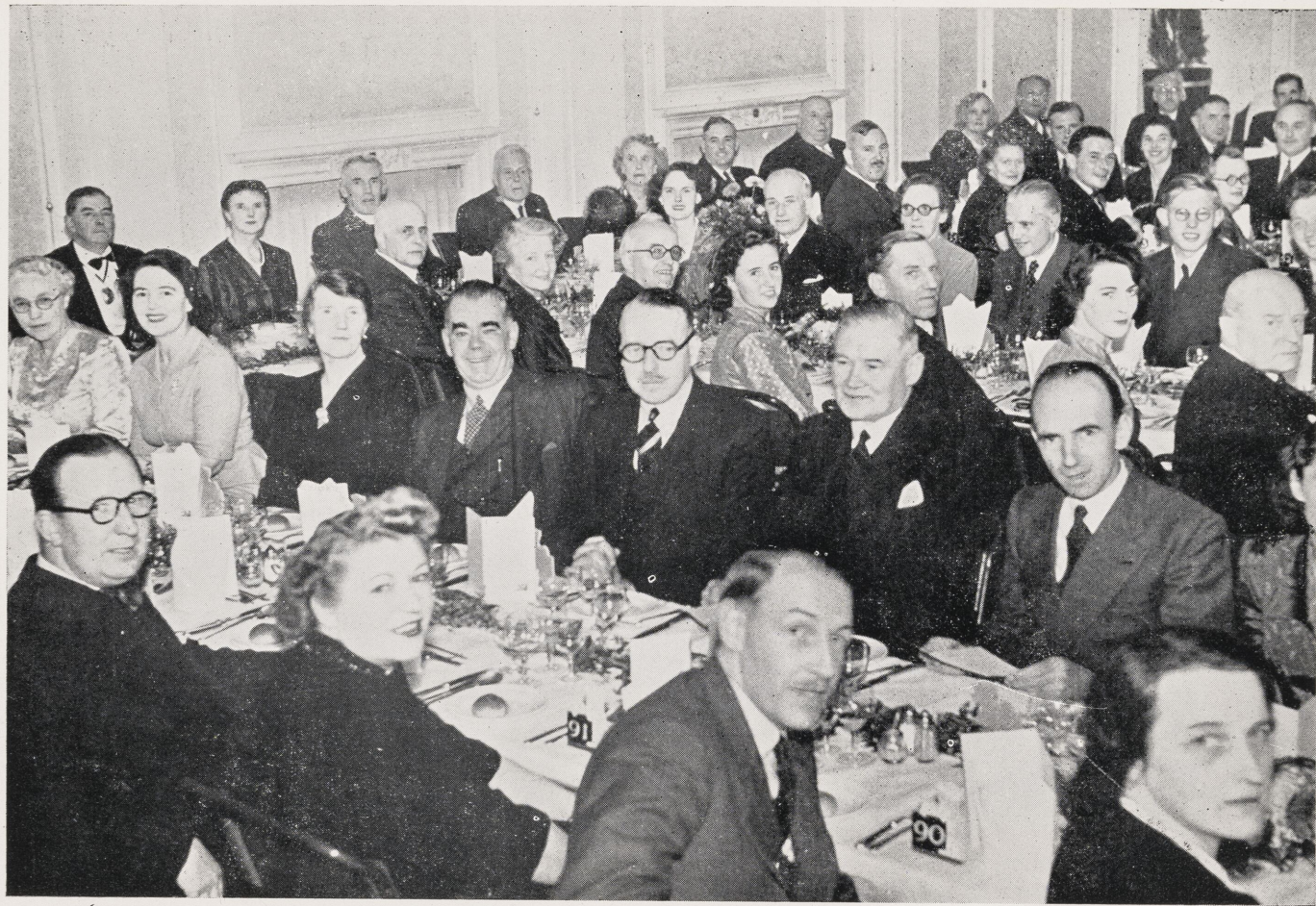
Guests at the Dinner given by the Council of The North of England Zoological Society.