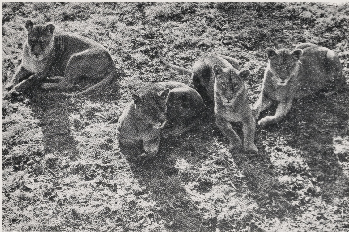
A scene of Summer contentment in the Lion Enclosure at Chester Zoo.