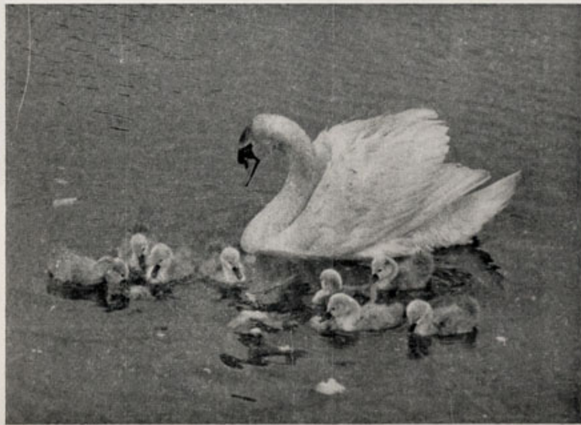
"CHESTER CHRONICLE" PHOTOGRAPHS