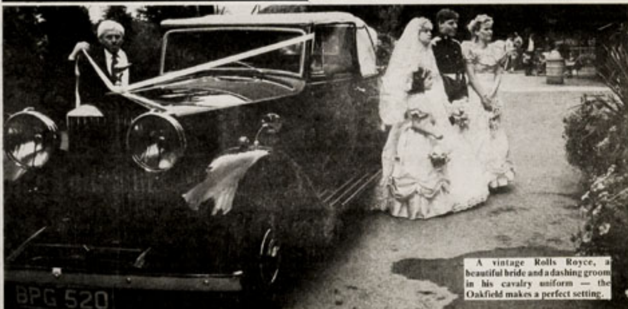
A vintage Rolls Royce, a beautiful bride and a dashing groom in his cavalry uniform — the Oakfield makes a perfect setting.