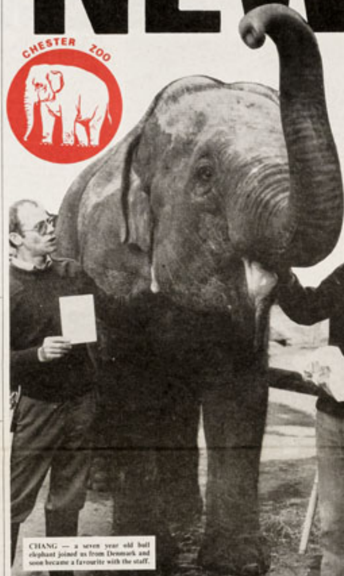
CHANG — a seven year old bull elephant joined us from Denmark and soon became a favourite with the staff.