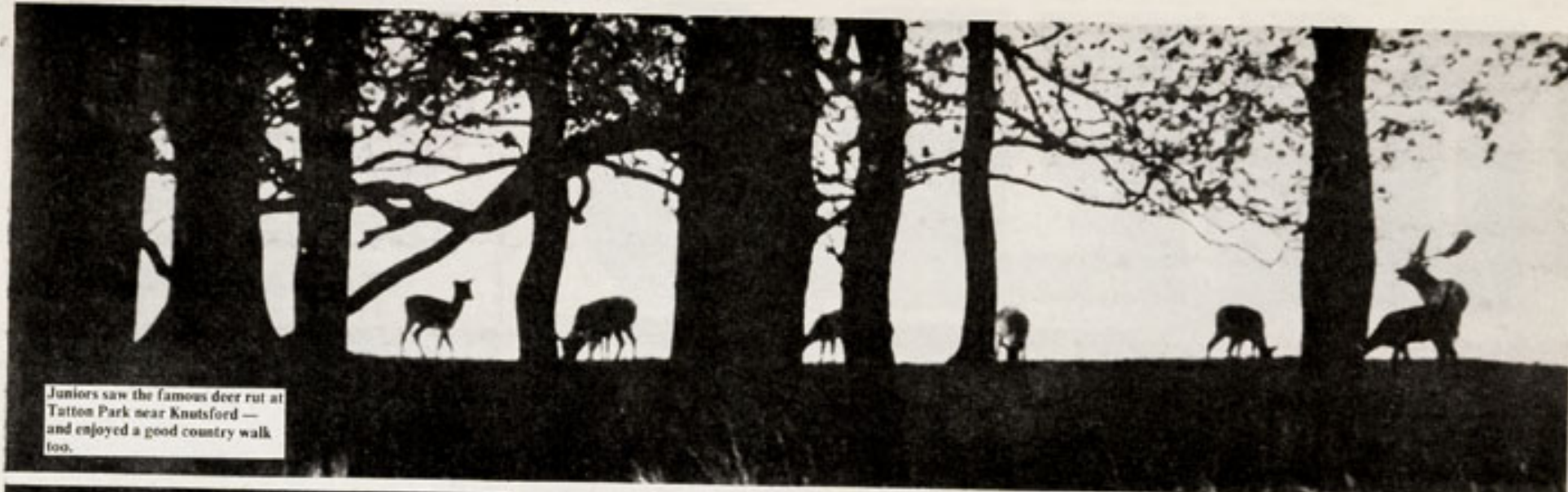
Juniors saw the famous deer rut at Tatton Park near Knutsford — and enjoyed a good country walk too.