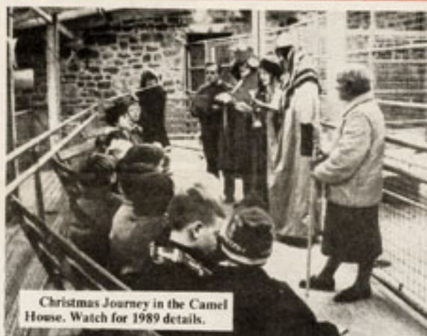
Christmas Journey in the Camel House. Watch for 1989 details.

AND ALL OTHER FAVOURITES From every Kiosk, Cafe & Restaurant in the Zoo