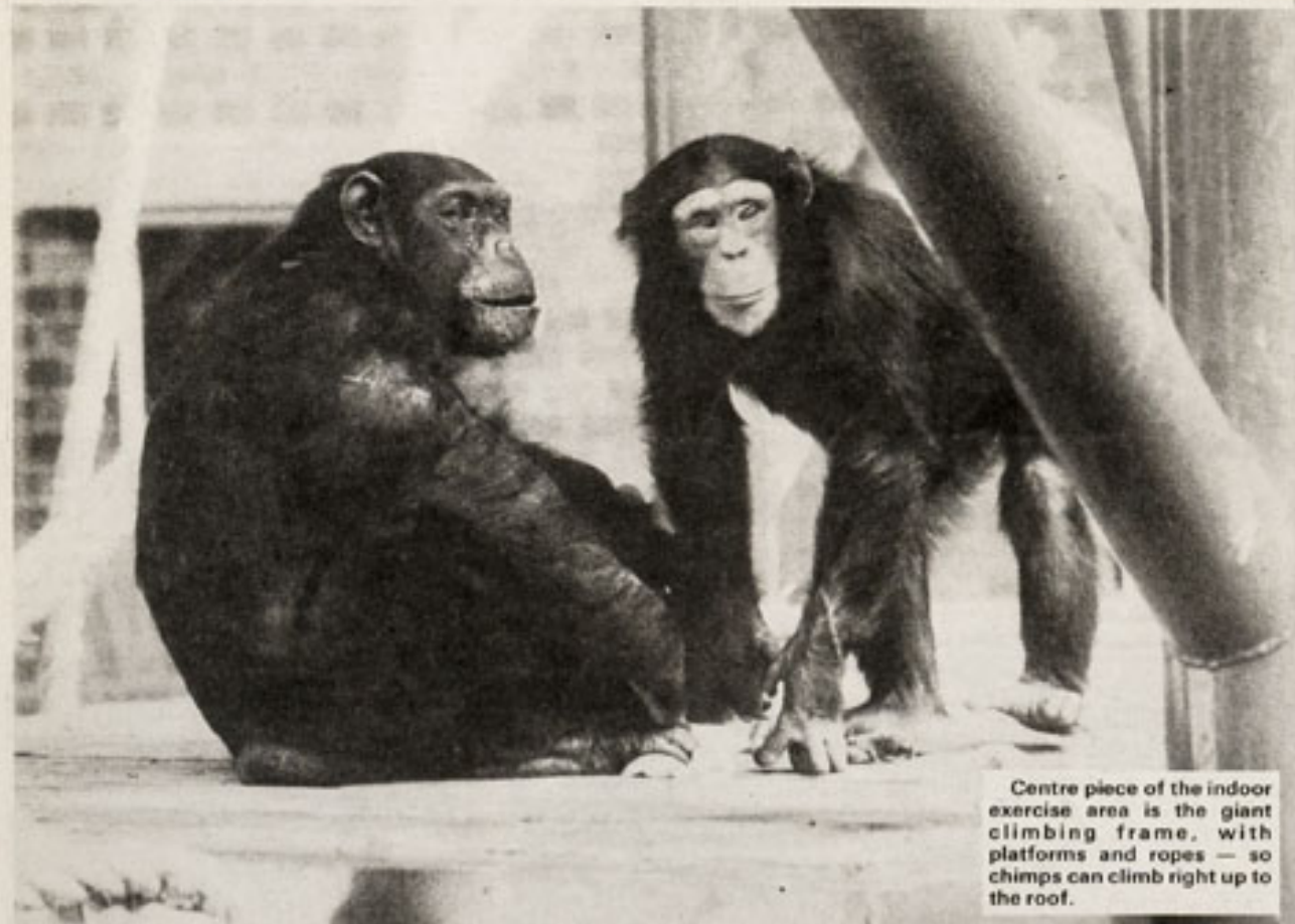
Centre piece of the indoor exercise area is the giant climbing frame, with platforms and ropes — so chimps can climb right up to the roof.