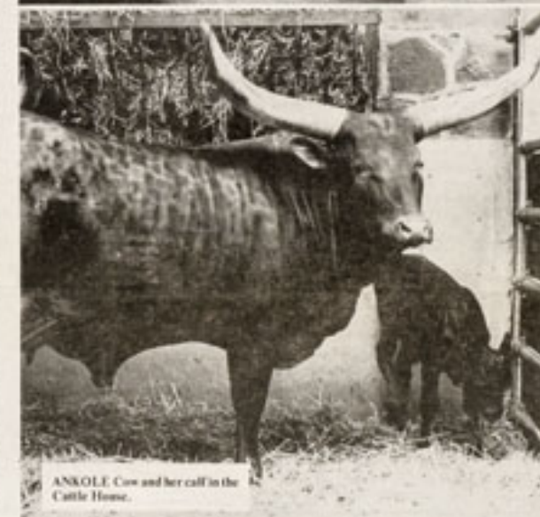
ANKOLE Cow and her calf in the Cattle House.