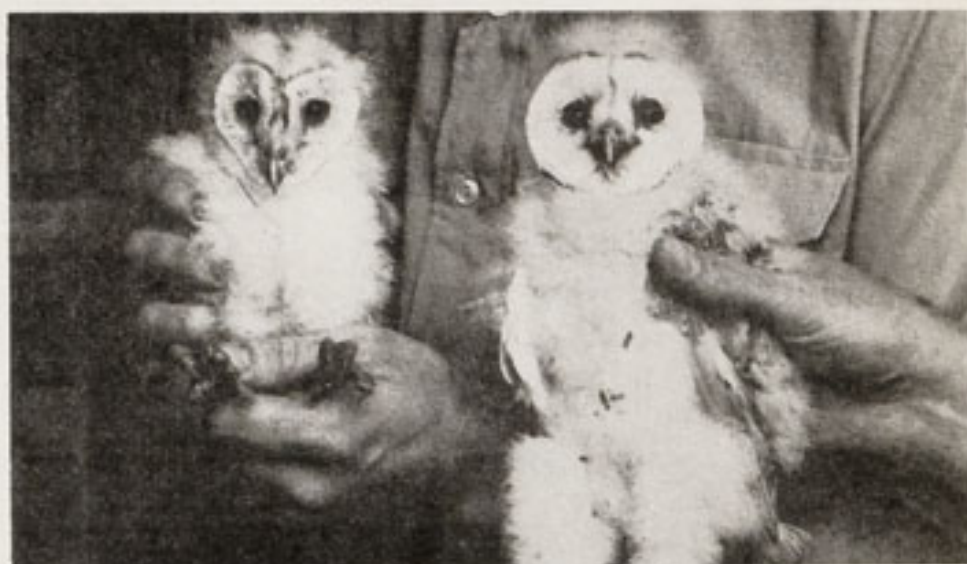
Young owlets are taken from the Zoo for local release.

In 1987, we had an excellent year, and 18 birds were released and in 1988, we provided a further 17.