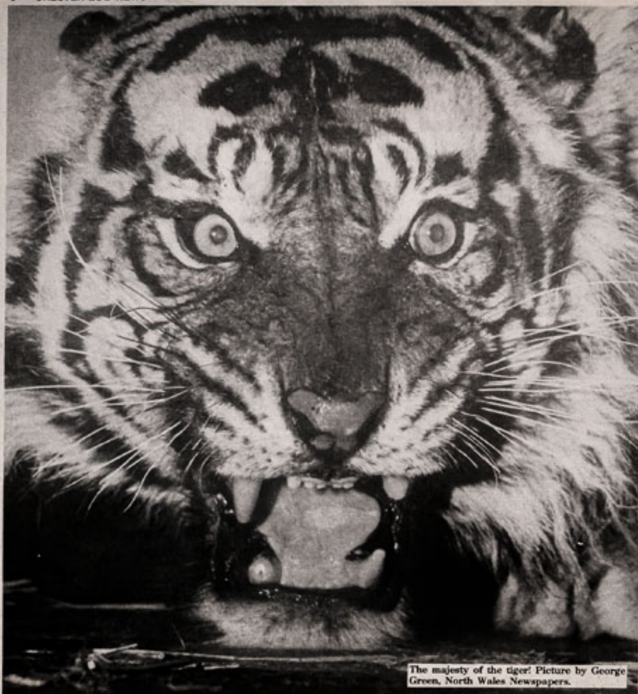
The majesty of the tiger!