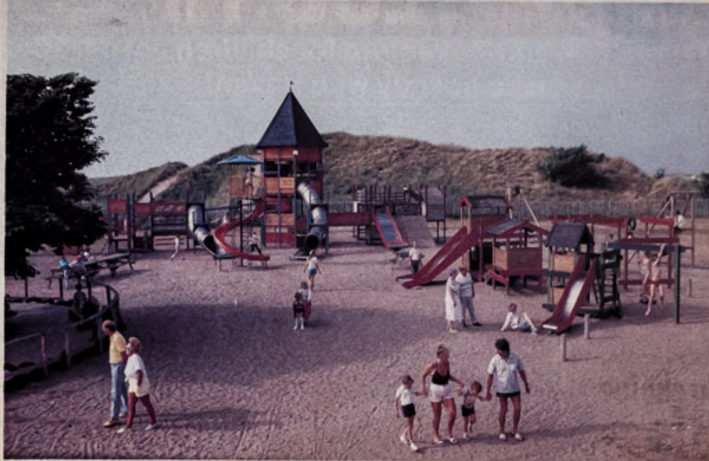
Great play areas

WHEN YOU BOOK A HAVEN HOLIDAY - Choose from 31 sites throughout England & Wales