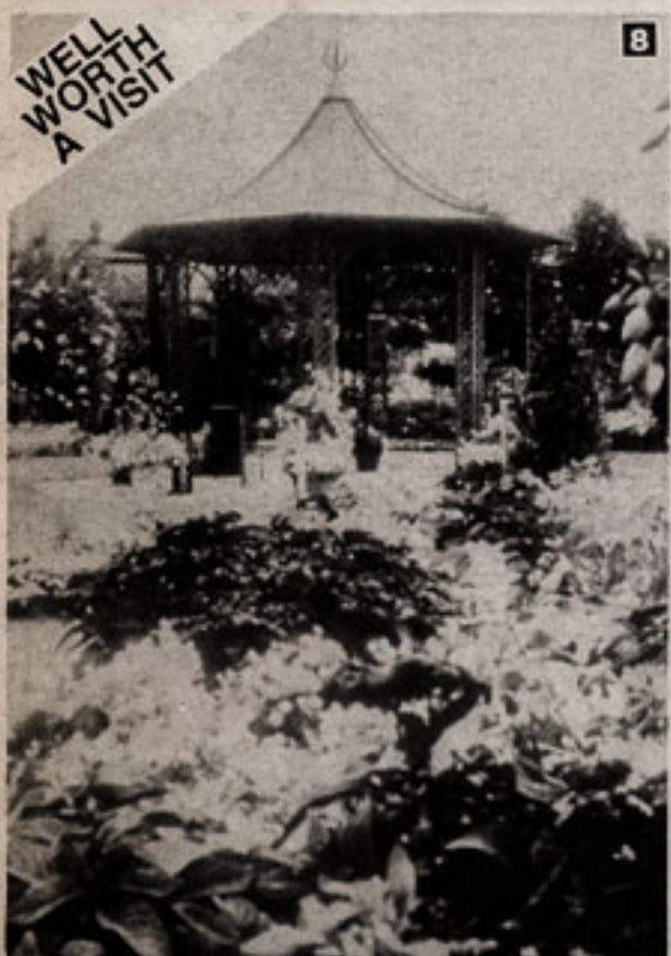
Bridgemere Garden World

Twenty-five acres of fascinating plants and garden with more plants and more varieties than anywhere in Europe. Huge selection of houseplants, garden bookshop, coffee house — recommended by Egon Ronay. Open daily. Admission free but charge for Garden Kingdom. On A51 between Woore and Nantwich, 25 miles from Chester. Tel. (09365) 381/2, also visit our Wildlife Park — from 10am (09365 223).