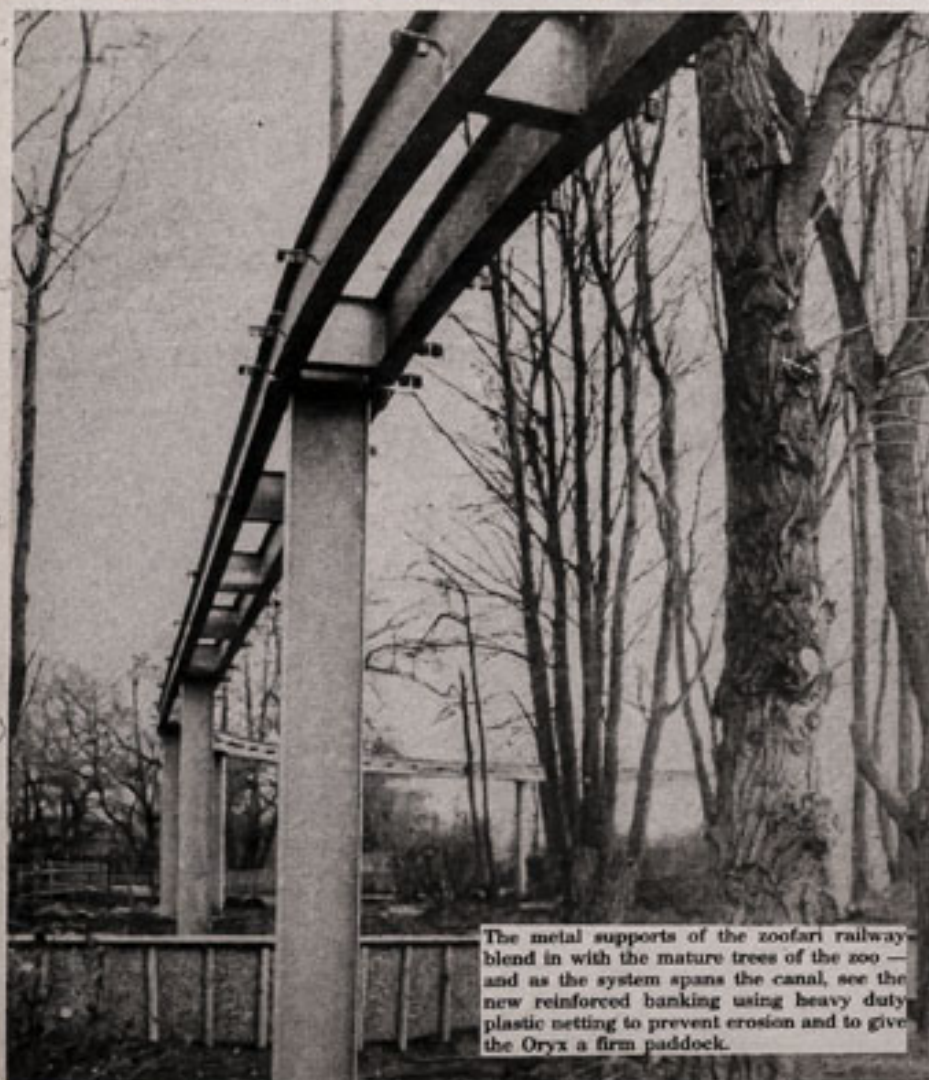
The metal supports of the zoofari railway blend in with the mature trees of the zoo — and as the system spans the canal, see the new reinforced banking using heavy duty plastic netting to prevent erosion and to give the Oryx a firm paddock.

"This investment shows our total confidence in the Zoo's approach to the 1990s and beyond", said Zoo Director, Dr Michael Brambell — and we believe that with Zoofari Overhead and Waterbus too, the Zoo's transport system will cope admirably with our million plus visitors!