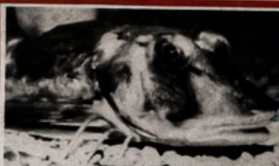
Picture shows red gurnard.