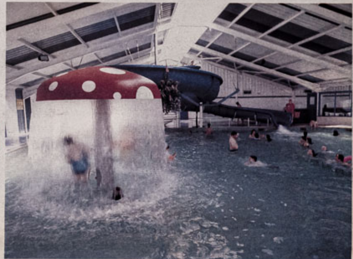
Presthaven Sands, North Wales

DIAL-A-BROCHURE 0883 340721 DIAL-A-BOOKING 0442 233111 OR SEE YOUR TRAVEL AGENT