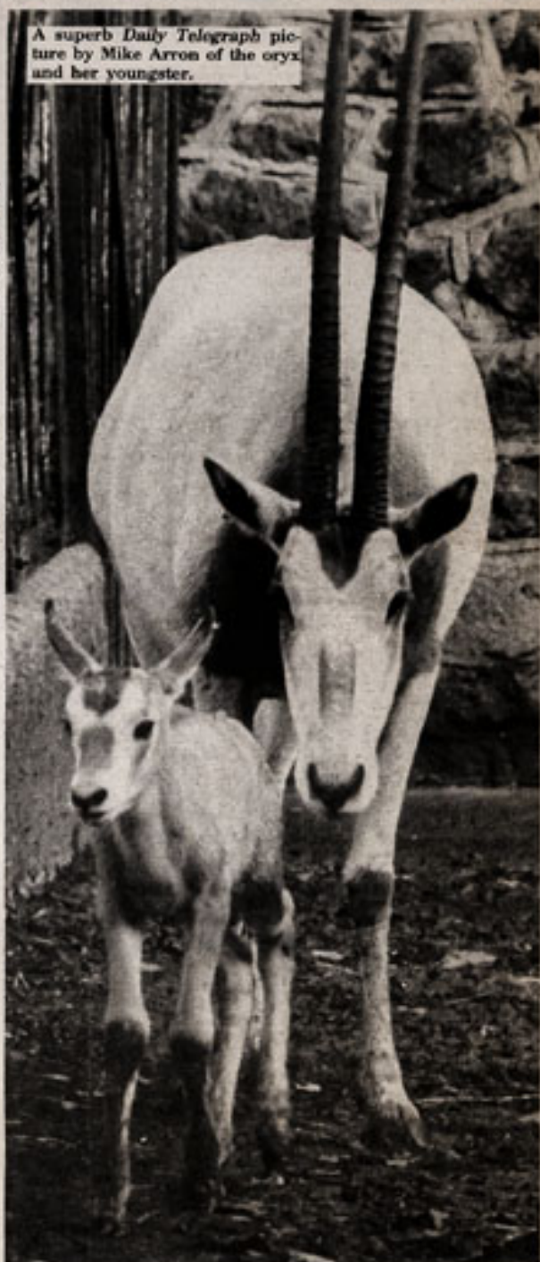
of the oryx and her youngster.

With the re-introduction programmes, British zoos hope to be able to save this species in the same way that the Arabian oryx was saved from total extinction in the 1970s.