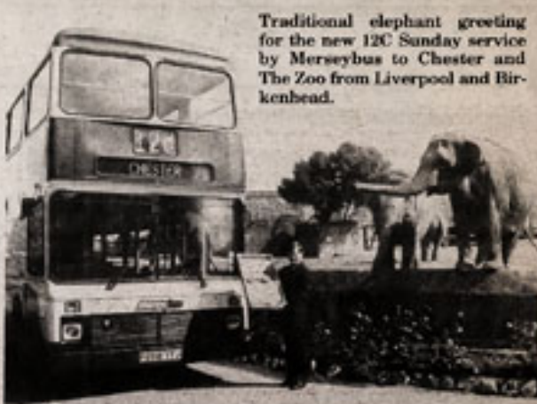
Traditional elephant greeting for the new 12C Sunday service by Merseybus to Chester and The Zoo from Liverpool and Birkenhead.