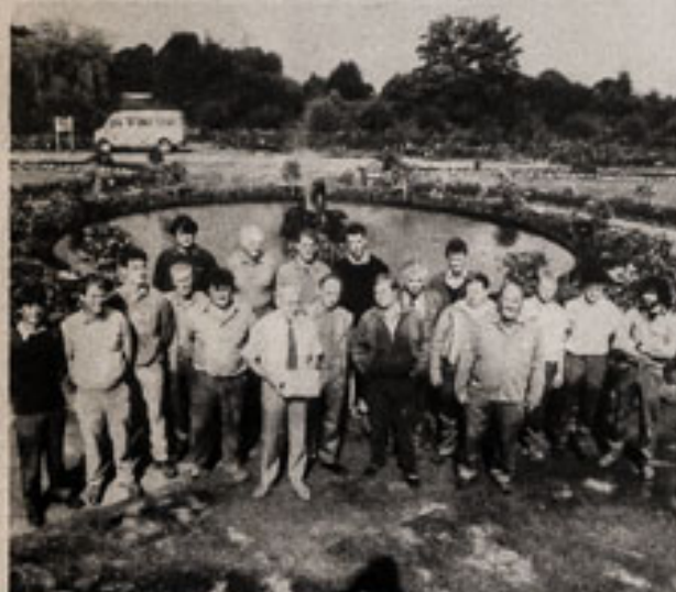
Last year was a great one for the zoo's 22 gardeners — they won three major prizes!

For the third time in five years, Chester Zoo was awarded the Britain in Bloom trophy for the best Tourist Attraction garden in the North West. A special award for outstanding achievement was gained in the Chester in Bloom competition. In May, three other glorious gardens in the region Ness, Tatton Park and Arley Hall — joined with the zoo to build a Cheshire Woodland Garden for the world's foremost gardening event — the Chelsea Flower show. It was the first time a consortium had entered the show, and all the partners were delighted to be awarded a coveted Silver Medal.